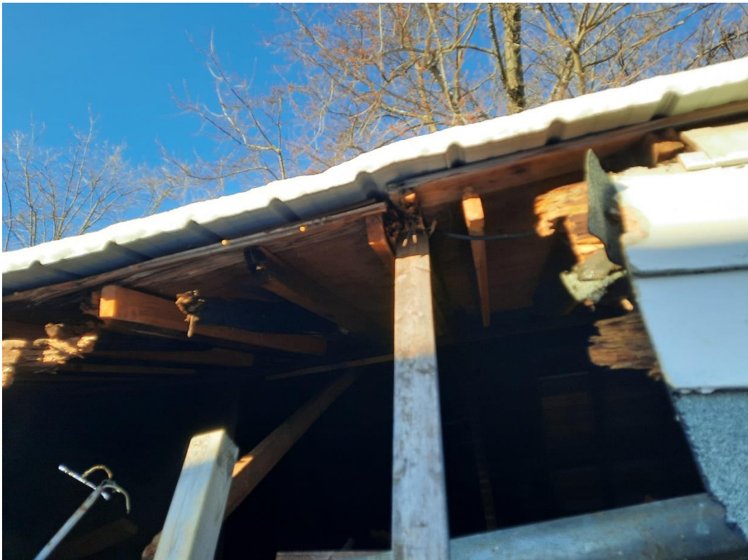
2 - Unsupported roof framing