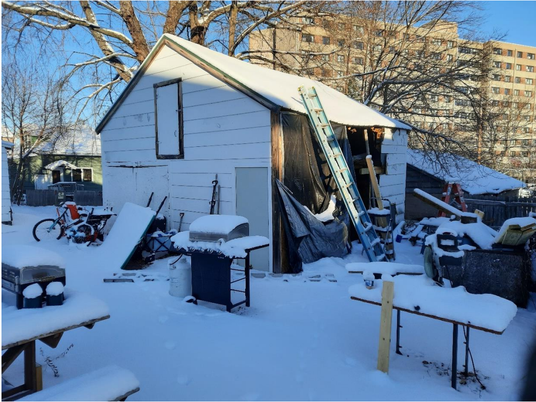
1 - Exterior of structure