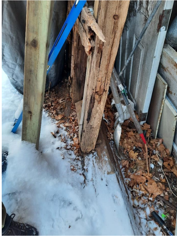
5 - Sill rotated out of position