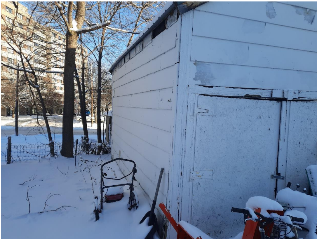
6 - West wall bowing out due to collar tie failure