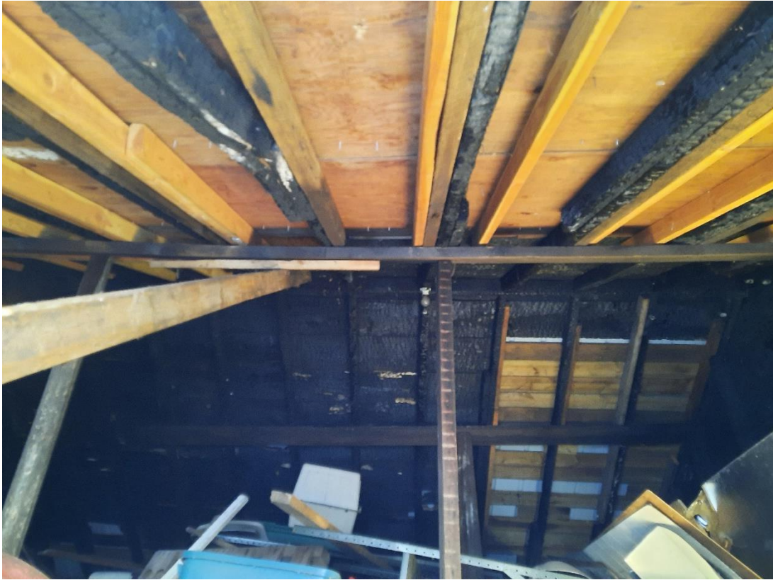
3 - Charred roof framing