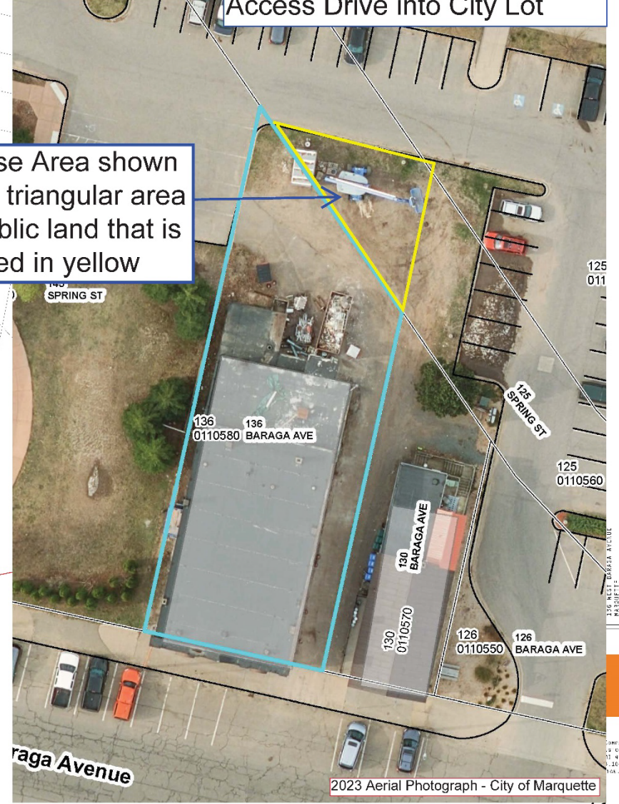
ARCHITECTURAL SITE PLAN SCALE: 1" = 40'