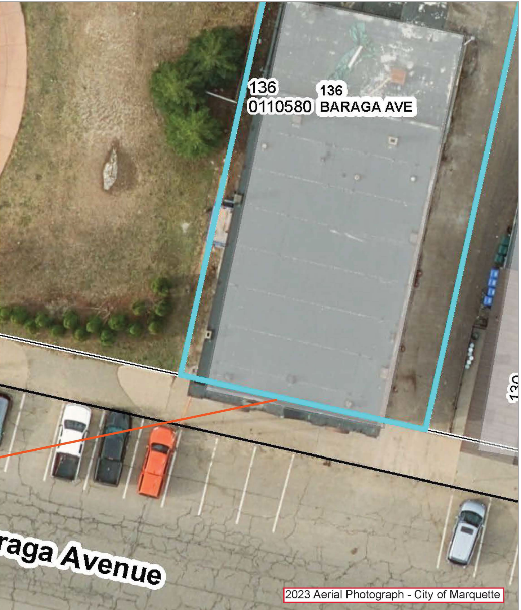
2023 Aerial Photograph - City of Marquette

APPROXIMATE LOCATION OF LICENSE AREA - INSIDE ORANGE RECTANGLE