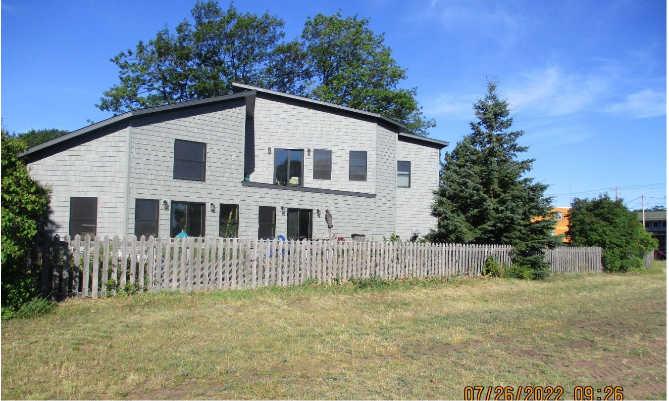
Fence on the east side of the Treado property at 848 Cedar St., adjacent to municipal parcel #0490040, looking from south to north.