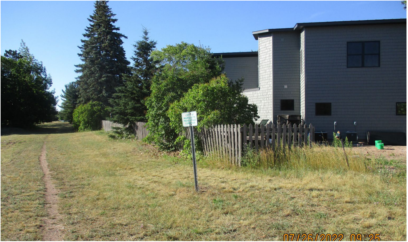
Looking south from the north end of the existing fence adjacent to 848 Cedar St.